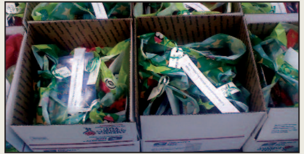
Left: Al Williams gives blood during a recent HCWSA blood drive, which resulted in 22 units being donated.