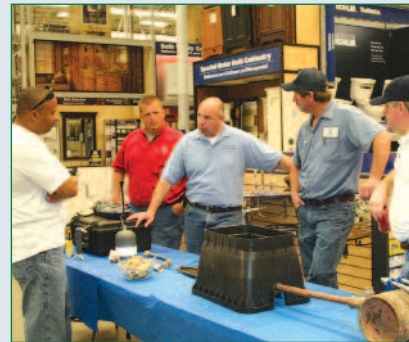
HCWSA employees participate in last year's Fix-a-Leak Week event at Lowe's in McDonough. No matter the time of year, HCWSA customers are encouraged to find and fix household leaks.

For more information on finding and fixing leaks, check out our Web site at www.hcwsa.com/detecting-a-leak ; and, for additional information on WaterSense programs, log onto www.epa.gov/watersense .